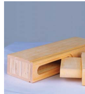
▲ Engineered stile with mortise & tenon joint