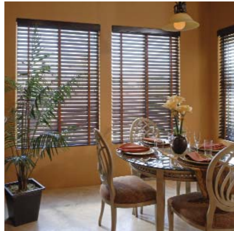
Open or shut, light or shade; Rialto blinds can go solo or be used to match shutters within the same property

“Classic or Contemporary, Rialto blinds blend seamlessly into their surroundings”