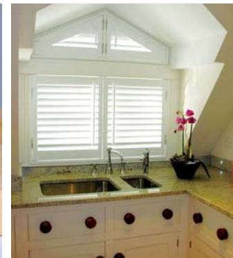
▲ Due to the made-to-measure nature of shutters even the most awkward shapes can be catered for