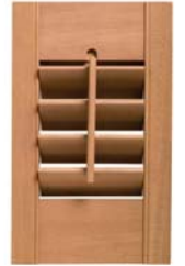
S- Shaped Louvre