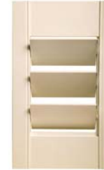
89mm & Hidden Tilt rod

Our shutters have either 6 coats of paint or 7 coats of stain to give a tough, lustrous finish. We offer a large selection of standard colours and stains and are able to match colours from numerous well known trade palettes as well as a custom colour match against a sample.